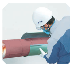
Heat retention maintenance work “Overlapped Heat Retention method”

2015 Acquired the Energy Conservation Grand Prize The products were well received because they contribute to promoting energy saving of a wide variety of industrial furnaces, and their application is expected to expand, for example, for fuel cells.