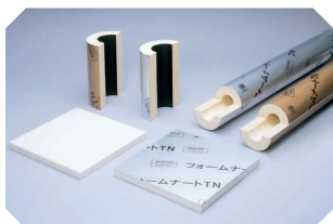
Rigid urethane foam thermal insulation material “FOAMNERT™ TN”

Global environmental issues, including global warming, are in a serious state requiring global-scale measures such as energy saving.