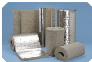
Rock wool products

2004 Acquired the Excellence, Ozone Layer Protection and Global Warming Prevention Award. It was highly evaluated for not containing chlorofluorocarbon-derived foaming agents.